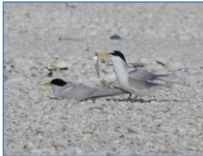
Least Tern courtship

disturbance that flushes birds from their nests, threatens their survival. These birds depend on southwest Florida beaches for nesting and to raise their chicks.