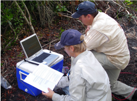
Top to bottom: Hydrologic restoration of Rookery Bay mangroves; Rookery Bay convenes stakeholders on a regular basis; field monitoring of fresh water flows.