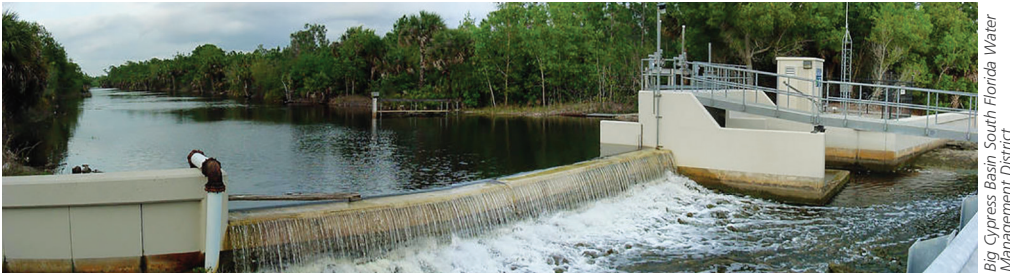
Top: A conceptual diagram illustrating water cycle processes included in the local scale model. Bottom: An intricate system of canals, weirs, and ponds are operated seasonally to shunt water off the land to prevent flooding in the summer, and hold back water to recharge aguifers in winter.